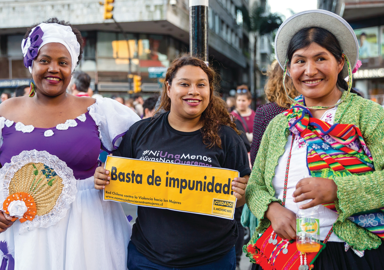
UN Women/Sahand Minae