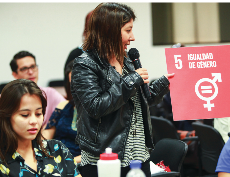
UNDP El Salvador

The Initiative used several indicators to ascertain the prevalence of femicide in the region. Due to significant challenges – for instance, the need to improve access to information and data comparability between countries and differences in the classification of crimes and the treatment of the information – three different indicators were used to create a composite measure of the prevalence of femicide in Latin America.