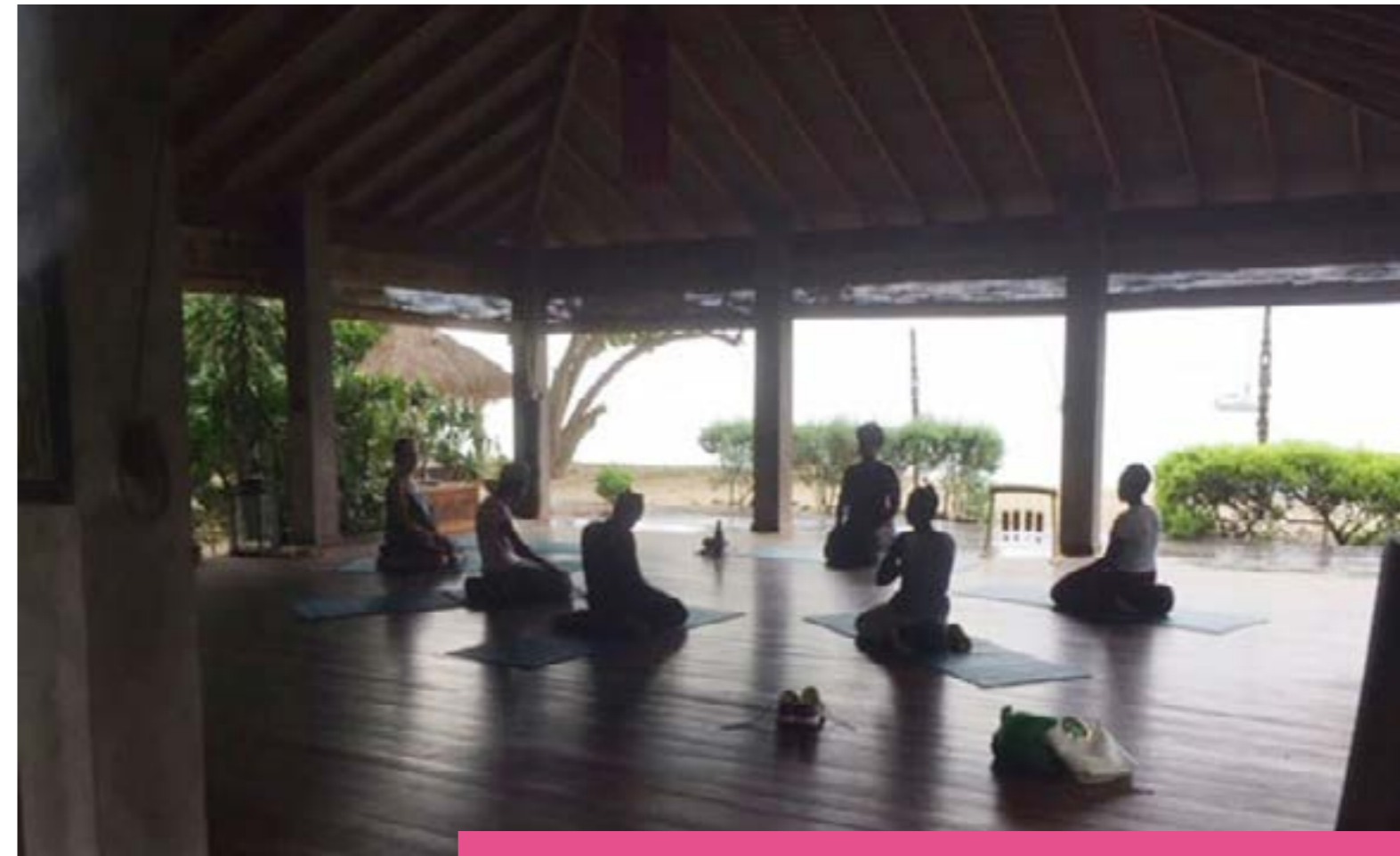
Yoga therapy is one of the many activities survivors of violence can participate in through the Sweet Water Foundation's programme.

* Names have been changed to protect survivor's identity.