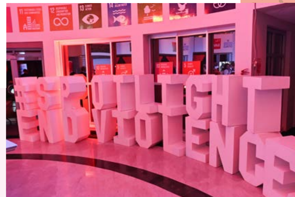
The Spotlight Initiative hashtag #SpotlightEndViolence lit up in the foyer of UN House.