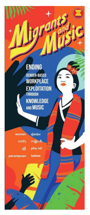
Figure 2. The post of the ASEAN Campaigns to Eliminate Violence against Women and its Links to the Prevention of Trafficking in Persons

The country has made progress on the following National Priority Areas (i.e., #4-#8 in the RPA on EVAW).