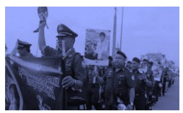
Photo: Chea Takihiro / Khmer Times, Ministry Promotes Good Men Campaign

91,000 followers and is liked by 90,261 people at the time of writing. On 18 and 19 October 2019, the page featured posts about the recently completed workshop on the media's implementation of the Media Code of Conduct for Reporting on Violence against Women, garnering hundreds of Facebook 'likes' and scores of shares. A video posted there of an interview with the President of the Club of Cambodian Journalists received over 1,400 views within five days.